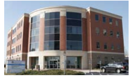
850 Southampton Avenue Norfolk, Virginia 23510