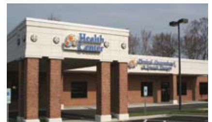
5835 Harbour View Boulevard Suffolk, Virginia 23435