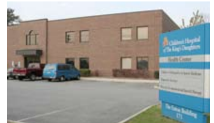
171 Kempsville Road Norfolk, Virginia 23502 (Buildings A & B)