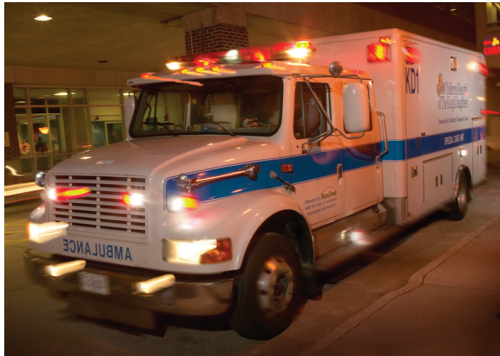
CHKD provides the region's highest level of mobile intensive care, the safest choice for infants and children.