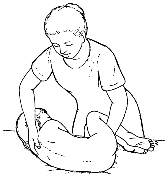
Curling up for a Lumbar Puncture (LP)